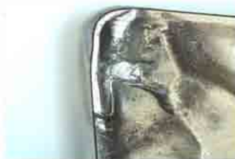
Competitor A After 280 linear inches