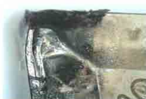
Competitor B After 240 linear inches