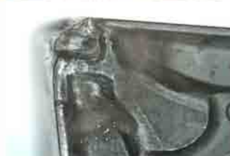
Competitor C After 208 linear inches