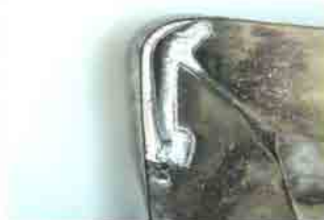
CNMG432MT TT8115 After 300 linear inches