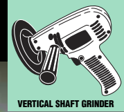
VERTICAL SHAFT GRINDER

The tool-free, twist-on and off fastening systems make fast work of disc changes to maximize productivity by minimizing downtime.