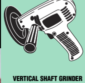
VERTICAL SHAFT GRINDER